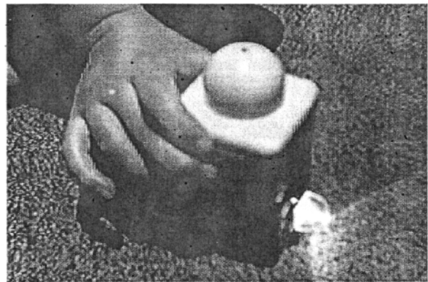
Figure 2: A touch block attached to a light block will cause the light to turn on whenever sensor plate is touched.

The addition of logic blocks to the set of Electronic Blocks opens up a wide variety of additional construction opportunities. In scenario 2, the not block provides Andrew with the capability to build a structure that only produces an action if a particular stimulus is not received. In Andrew's interactions with the Electronic Blocks, he worked out how to use a logic block to make his car construction more manageable.