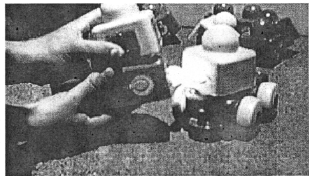
Figure 3: A remote control car demonstrates interaction between block stacks. The touch block on the light block forms the remote control for the car formed by placing a seeing block on a movement block.